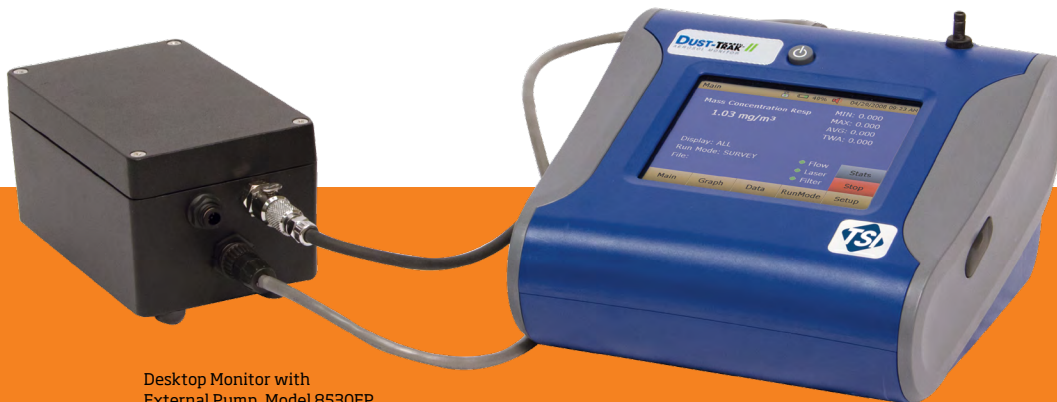
Desktop Monitor with External Pump, Model 8530EP