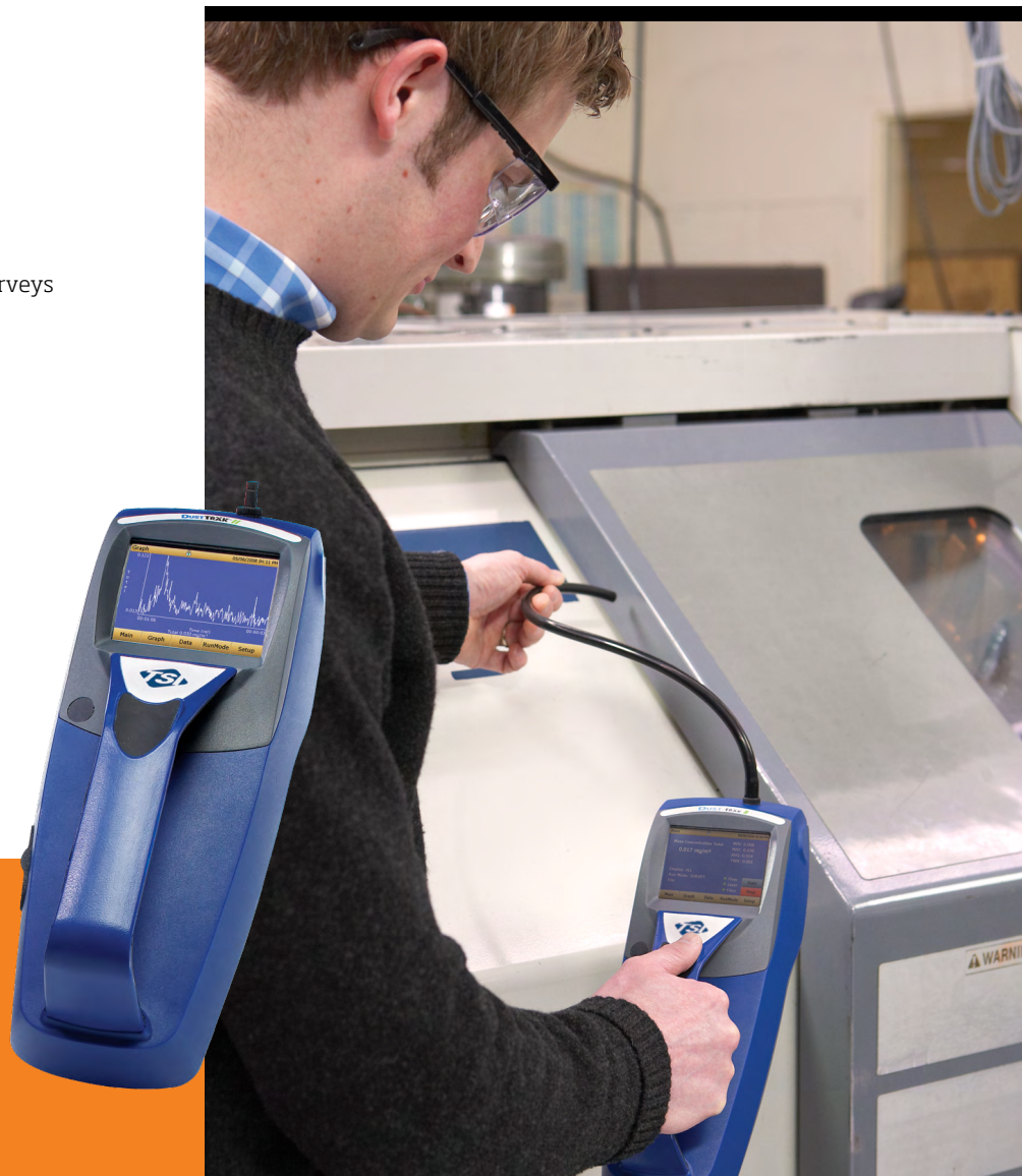
Handheld Monitor, Model 8532

TrakPro™ Data Analysis Software allows you to set up and program directly from a PC. It even features the ability for remote programming and data acquisition from your PC via wireless (922 MHz or 2.4 GHz) communications or over an Ethernet network. As always, you can print graphs, raw data tables, and statistical and comprehensive reports for record keeping purposes.